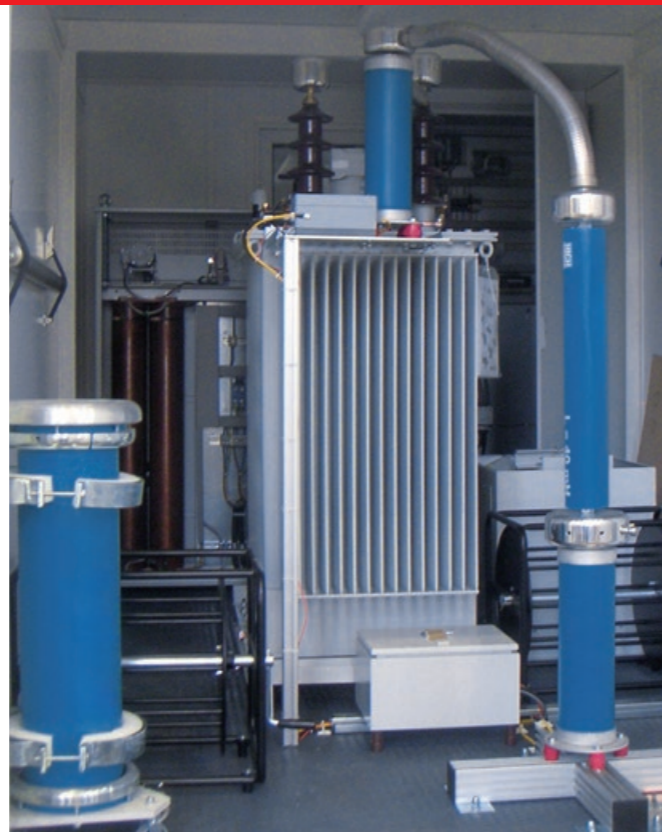
Fig. 2 Portable HVAC resonant test system type WR container variation