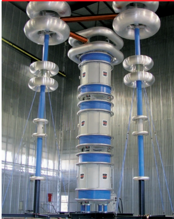
Fig. 1 HVAC resonant test system type WRM